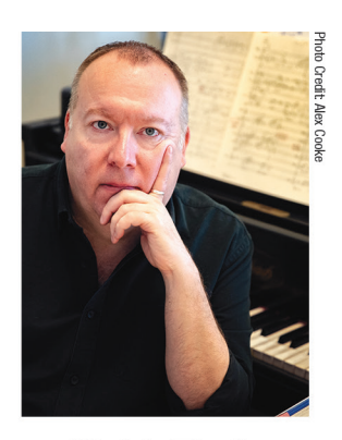
Keith Fitch Composer

Called "gloriously luminous" by The Philadelphia Inquirer , the music of Keith Fitch has been consistently noted for its eloquence, expressivity, dramatic sense of musical narrative, and unique sense of color and sonority. The Wall Street Journal praised "the sheer concentration of his writing, and its power to express a complex, unseen presence shaping the course of musical events." The American Academy of Arts and Letters wrote, "[his] music reveals an individual landscape that concentrates on unusual textures and sounds—all within a strong narrative that drives towards a rich and powerful conclusion."